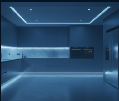
Fully Equipped Kitchens