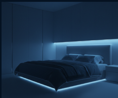
2 & 3 Bedroom Apartments

Each apartment at TOWERS is crafted for comfort and functionality